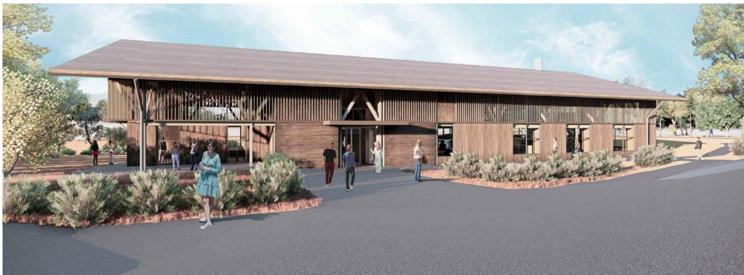
Main entry of the new Winthrop Public Library